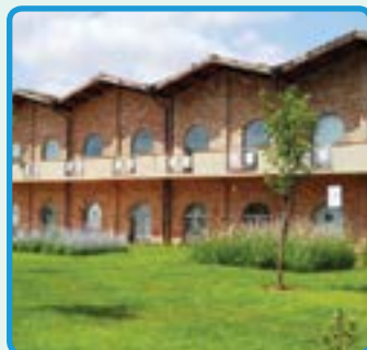
The charming ASEV offices in Empoli, Italy

In completing the videos for the 'After hospital care' unit Italian partner ASEV made good use of in-house talent to play the roles of various characters. While not quite Hollywood, there was still a sense of being 'movie stars' during the production process.