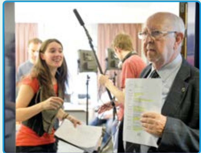
Filming by the Belgian International Academy for Film and Television (AIFT) with partner Linguapolis, Belgium

All videos have been produced to include optional subtitles, offering a degree of flexibility for teachers and learners, depending on learner needs.