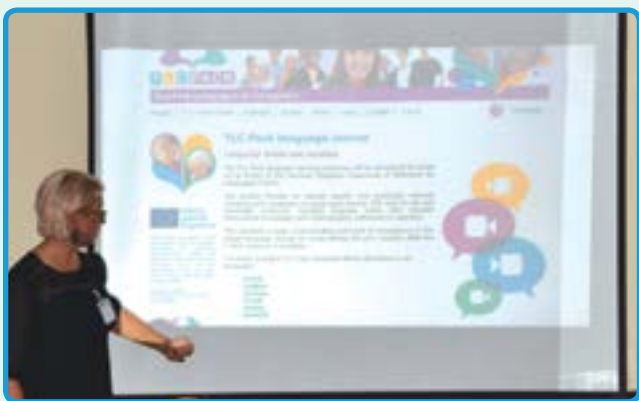
A VHS staff member presents the TLC Pack project at Expolingua in Berlin

UK: LEAP hosted a stand at the Erasmus+ dissemination conference in Birmingham, with the TLC Pack project the focal point of the stand. Members of the team were able to share project information and links with conference attendees, as well as discuss the project within two of the scheduled sessions. The event attracted around 300 visitors, many of whom represented language organisations in the UK.