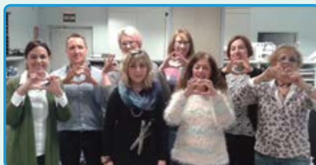
Attendees from the project partners creating the TLC Pack hand sign - Madrid January 2015

The focus of the meeting was the review and evaluation of the first round of learning materials, considering their production, piloting and relevance to future development.