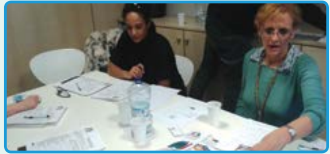
Participants at the 'TLC Pack learning materials for teachers' workshop in Madrid

As part of the TLC Pack piloting phase a training workshop under the name of "TLC Pack learning materials for teachers" was held at the offices of Instituto do Formación Integral (IFI) in Madrid . Professionals from a number of organisations working with migrants attended.