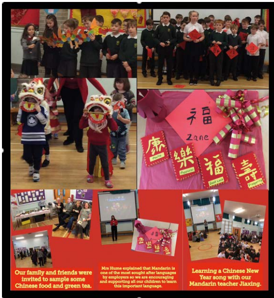
Our family and friends were invited to sample some Chinese food and green tea.