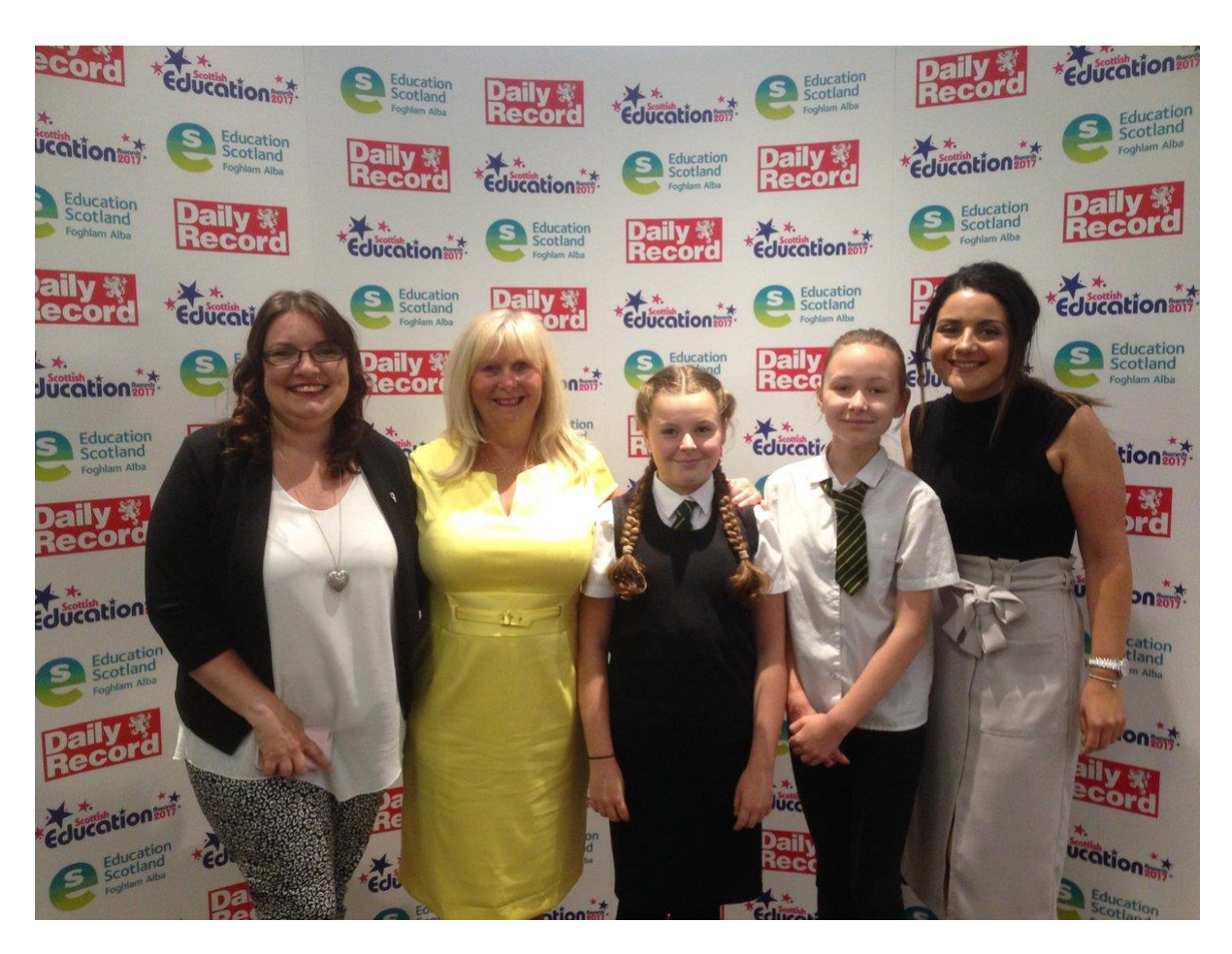
Progressing towards the "1+ 2 Approach"